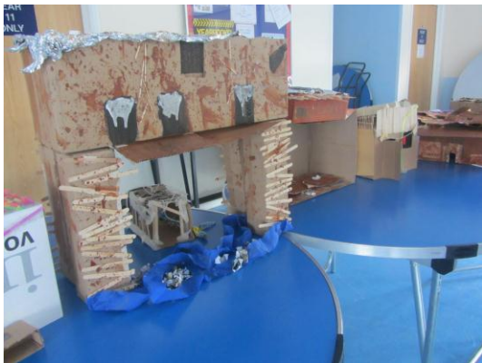
Model of shanty town